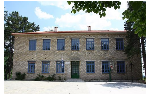
Karyes Primary School

The school year was completed with a celebration dedicated to the old Greek cinema.